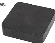
BEN404.00 4" x 4" x 1" $5.50

Vulcanized rubber block provides an excellent surface for filing, hammering or other uses. Remove dents and straighten metals without scratching, distorting or slipping. Use wet or dry.