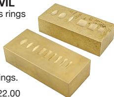
PU014 Combination $22.00

Brass anvil securely holds rings in place while stamping. Grooves are designed for different size ring shanks. One side for marking men's rings, the other side for ladies rings.