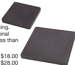
TX1435 4" x 4" x 1/2" $18.00

Aluminum blocks for stamping and flattening. Just as useful as traditional steel bench blocks at less than half the weight.