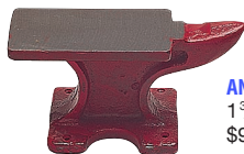
ANV550 1 3/4 lbs. $9.75

Made of cast steel. Smooth-ground, working surfaces. Economical anvil/bench blocks for flattening, stamping, bending and shaping.