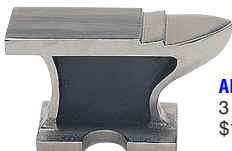
ANV555 3 3/4 lbs. $15.25