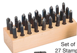
Set of 27 Stamps

Contains each letter of the alphabet and a period.